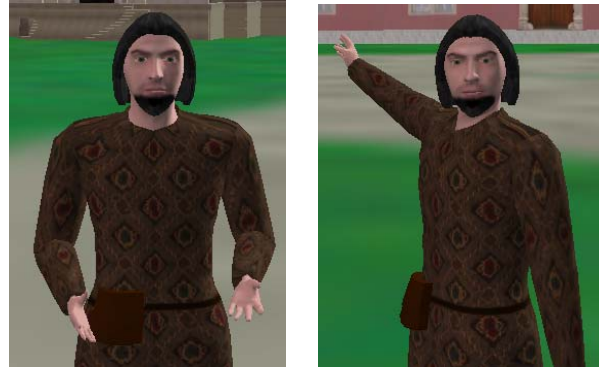
Figure 4: Raising hands and pointing gestures

Several eye, arms and hands movements were blended and combined with speech in order to make the avatar look more natural when interacting with the visitor. These movements created several gestures, including crossing arms, thinking, shrugging, raising hands and pointing (see figure 4).