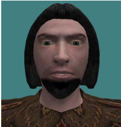
Figure 3: Example of primitive mouth shapes

The morph targets were created using a toolkit developed at UEA that enables interactive selection and weighting of vertices on the avatar face mesh, with facilities to apply transformations on these vertices including translation, rotation, and growth (expansion along vertex normals) to create the final morph target. The morph targets were named according to the face parameters, uploaded into the avatar, then blended and applied on a frame-by-frame basis.