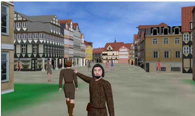
Figure 1: Example of buildings modelled in Wolfenbüttel's virtual environment

The town scene consisted of a small (500 m 2 ) region with important buildings and a much larger surrounding region of generic houses. A large proportion of the scene was constructed in a relatively short time by using the CHARISMATIC toolkit to rapidly create the generic houses and automatically position them along the roads. The open-source scenegraph OpenSG was used during this process. The important buildings of the town were then modelled using 3DStudio Max and included in the scene (see figure 1). Finally, parametric trees were added to the scene for realism.